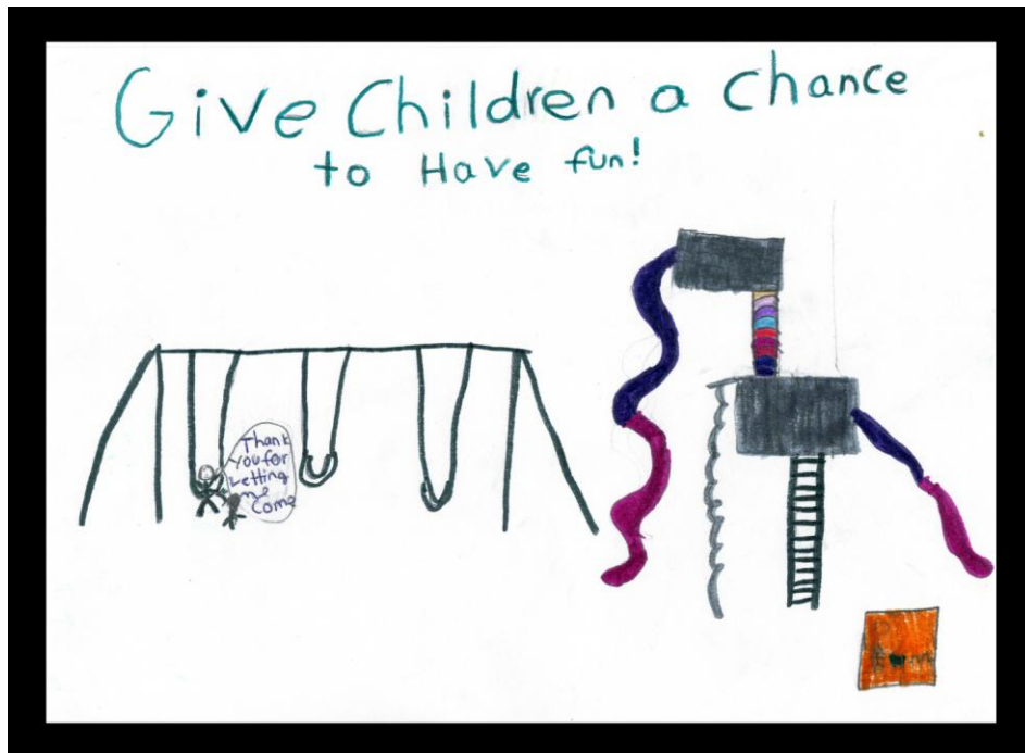
(Drawn By a Local Grade 5 Student)

Why should Elbow win the $10,000? It's simple. Elbow is READY to make a difference in our community and we are committed to providing a healthy future for our children! We currently do not have a safe playground for our kids ☹! Our project is already in the planning stages, and we know exactly what we would do with the money! And better yet, Elbow would be able to thank Saskatchewan In Motion for not only the $10,000...but actually $20,000! What an awesome opportunity!