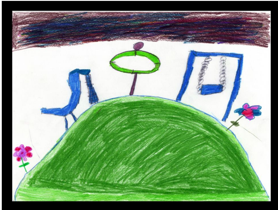
(Drawn By a Local Grade 3 Student)

We can already see how our involvement with the Community Pledge Challenge and with Saskatchewan In Motion has made families in our community more aware and accountable for the amount of physical activity that their children receive on a daily basis. One of the Elbow Community Park Project goals is to lead by example and demonstrate to our children, our families and all community members, that by working together anything is possible and dreams really can become reality! We want to thank the Community Pledge Challenge and Saskatchewan In Motion for allowing our entry in the contest to be an amazing catalyst for getting our community to not only rally together pledges for Elbow, but to also remind our citizens that – TOGETHER we really can get our kids moving more! TOGETHER WE WILL SUCCEED!