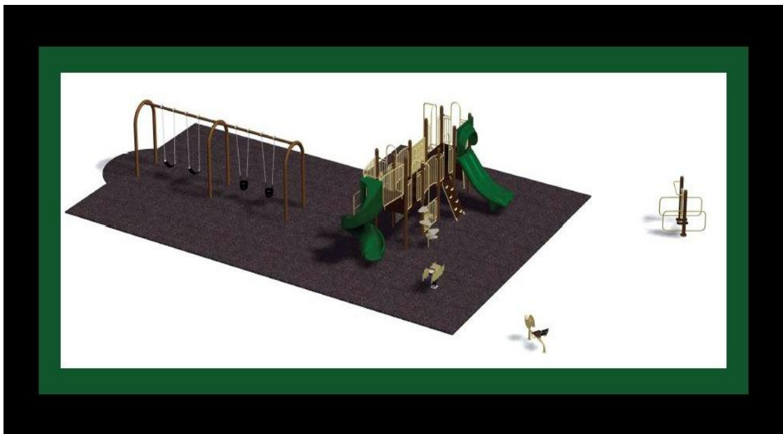
(Our future playground!)

To get the children and youth involved in our project, we held a “Dotmocracy” at the local school, where children were able to view the components of the playground and were able to vote on their favourite pieces! With the children’s help we were able to create an initial design of what the playground might look like if we are able to raise the funds that are needed.