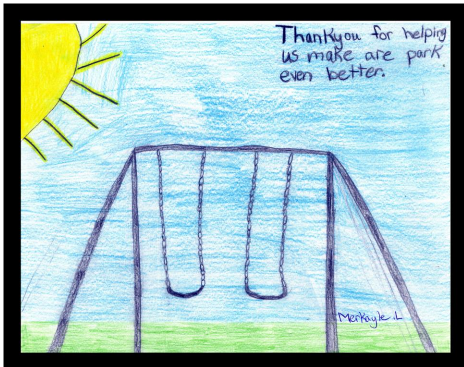
(Drawn By a Local Grade 5 Student)

Our project will take place on May 12, 2012. In just one day we will build a place for the children and families of our area to connect. We will bring everyone in our community together to achieve a common goal – building a playground for our kids. The project will help to develop a more united community empowered to create positive change! It will involve the whole community in the continued development of our park and will instil a sense of pride amongst citizens, while demonstrating the importance of volunteerism and physical activity. Currently we have over 90 volunteers officially registered for build day! Together we will create a space for all citizens to keep active, all year long and for years to come!